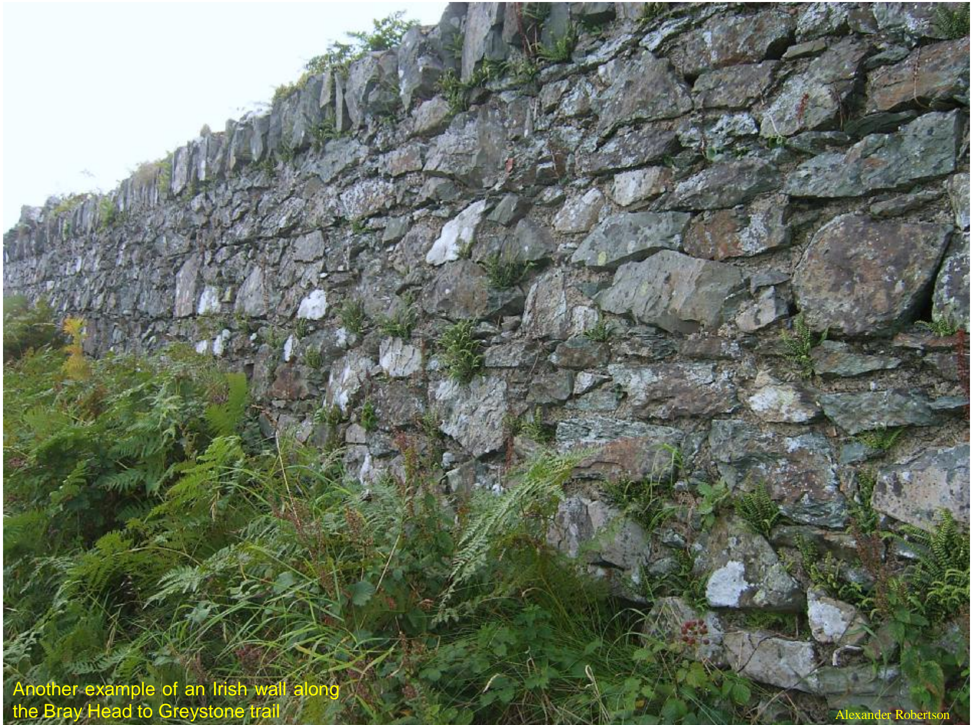
Another example of an Irish wall along the Bray Head to Greystone trail