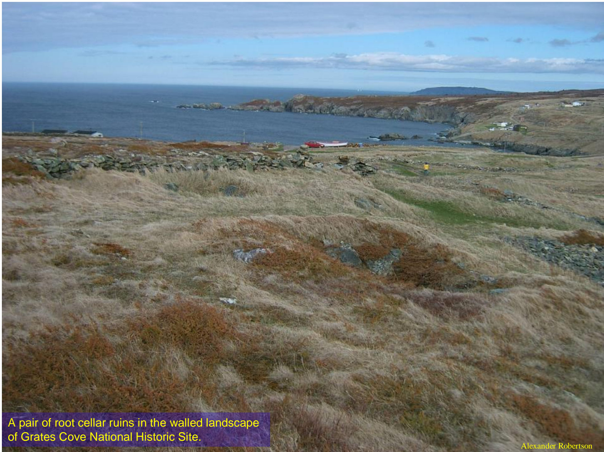
A pair of root cellar ruins in the walled landscape of Grates Cove National Historic Site.