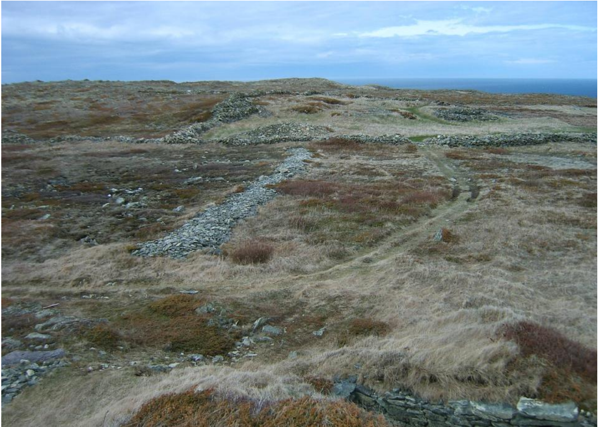
Walled Landscape of Grates Cove National Historic Site