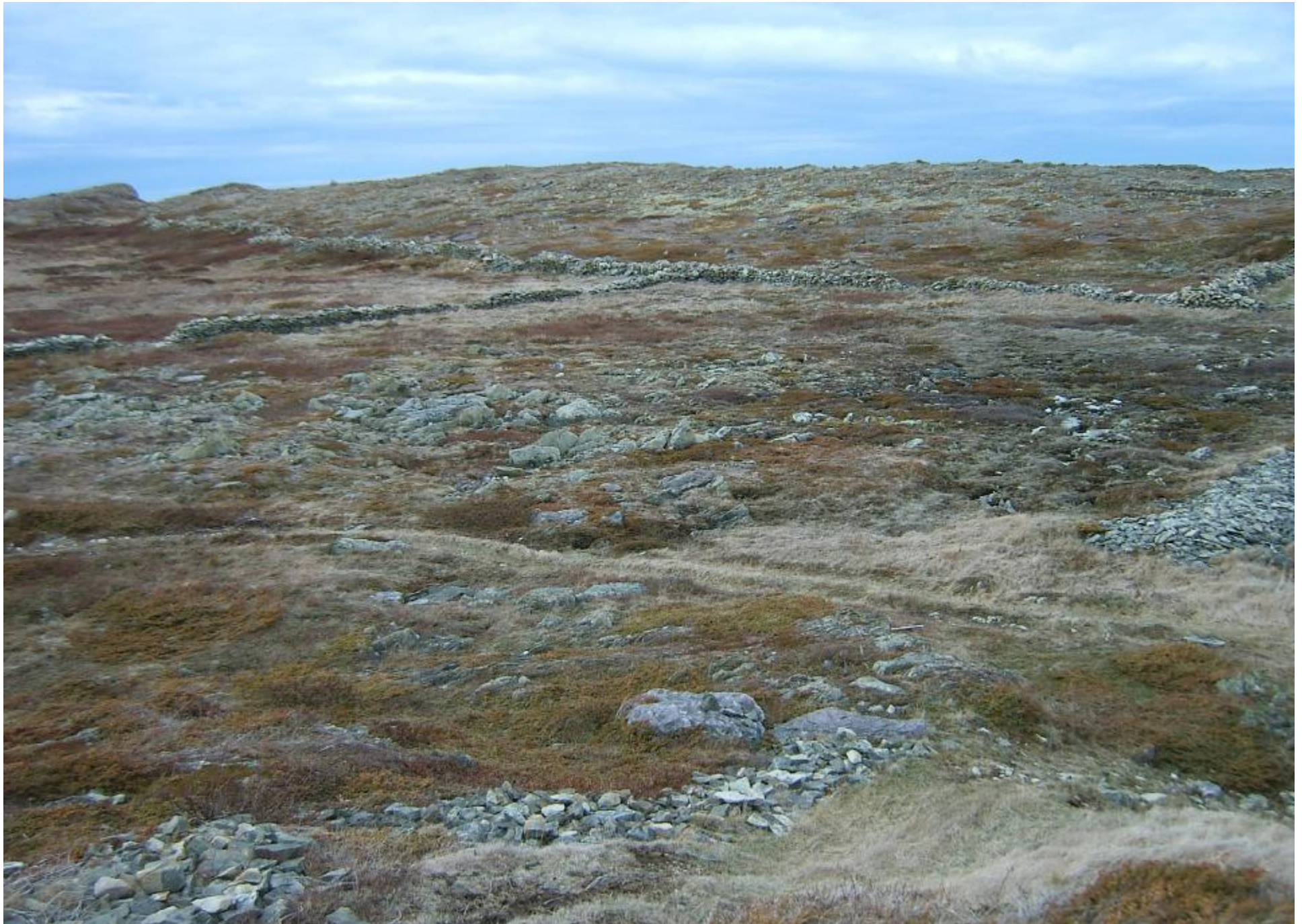
Walled Landscape of Grates Cove National Historic Site