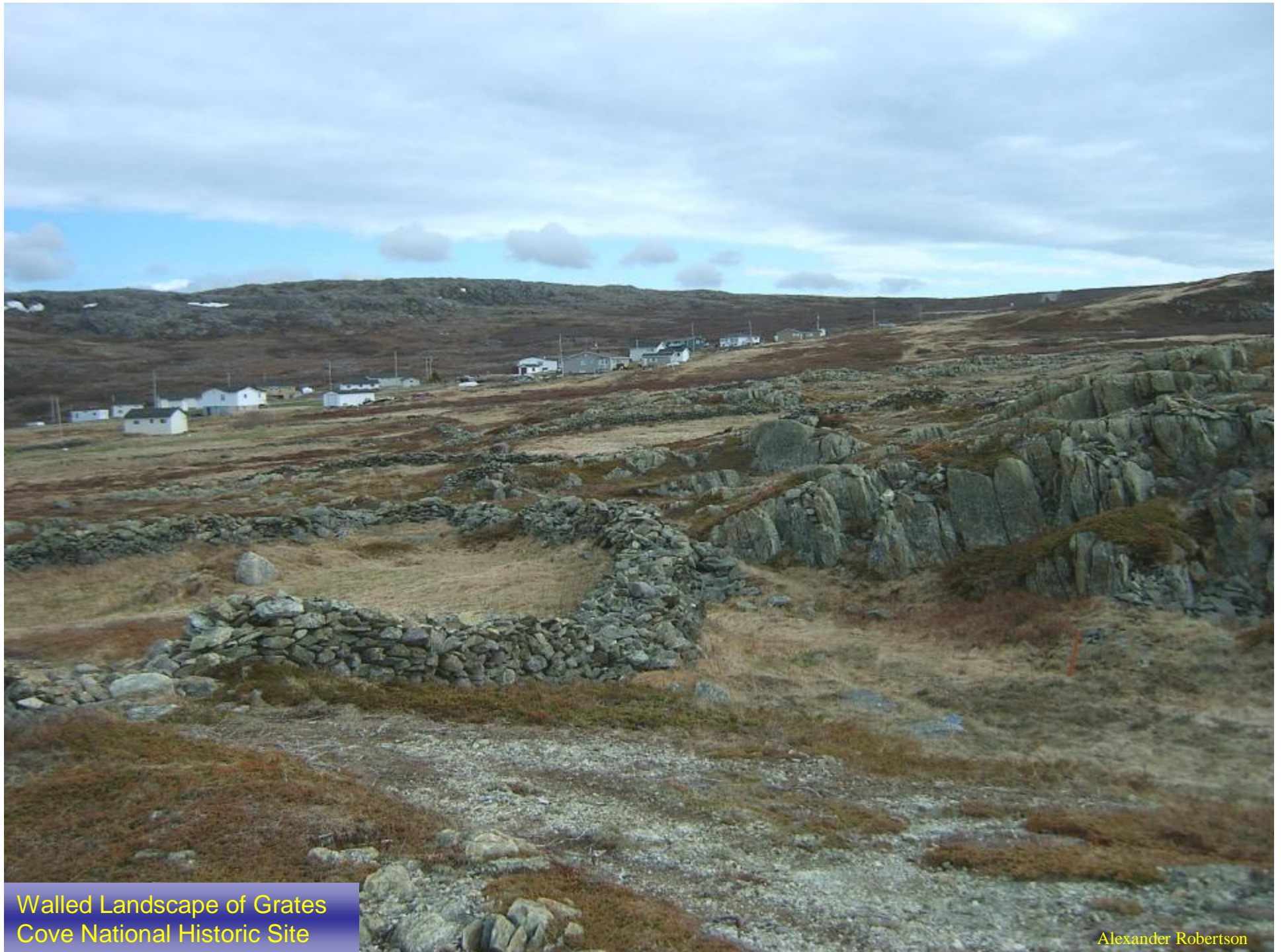
Walled Landscape of Grates Cove National Historic Site