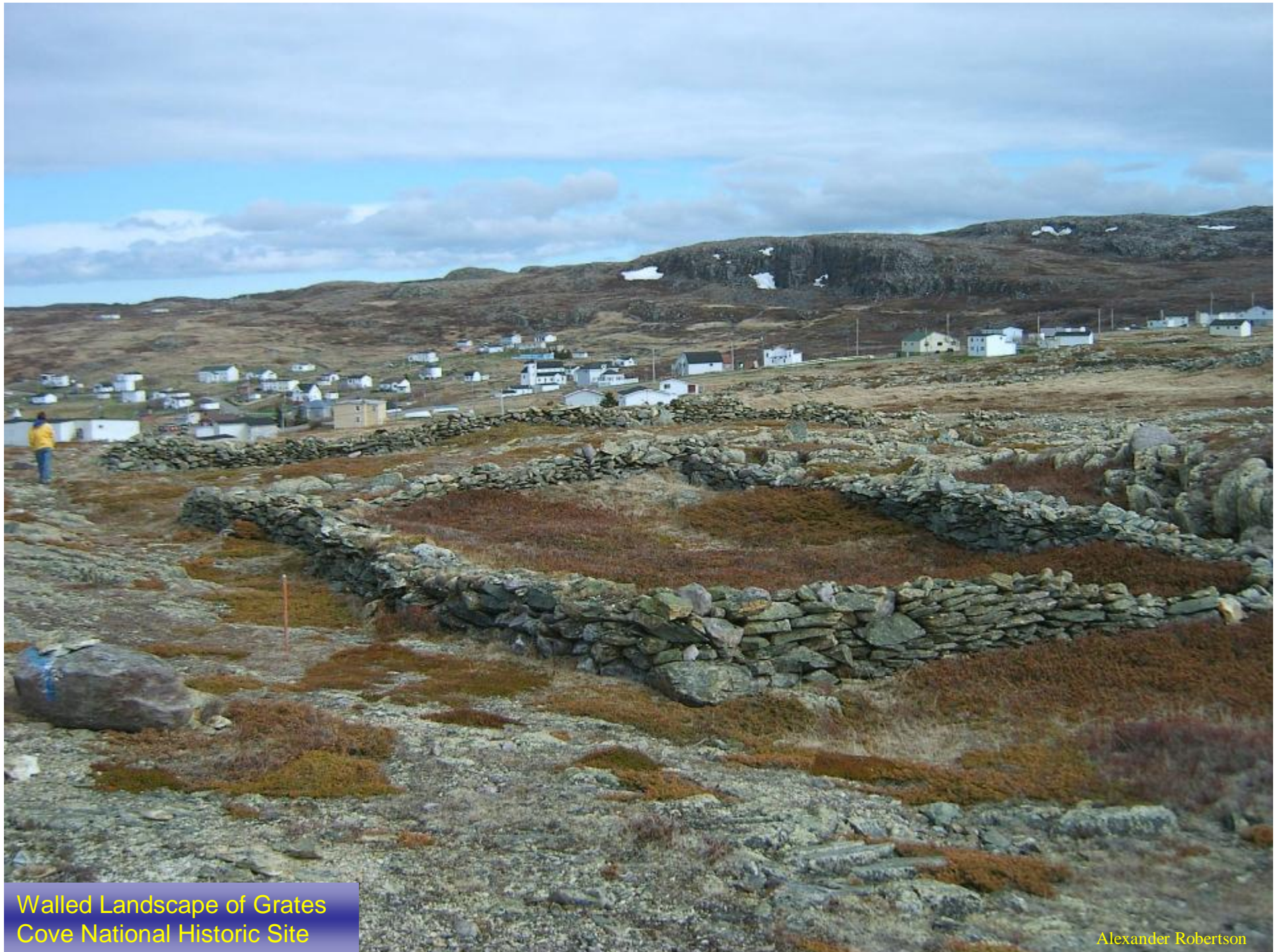
Walled Landscape of Grates Cove National Historic Site