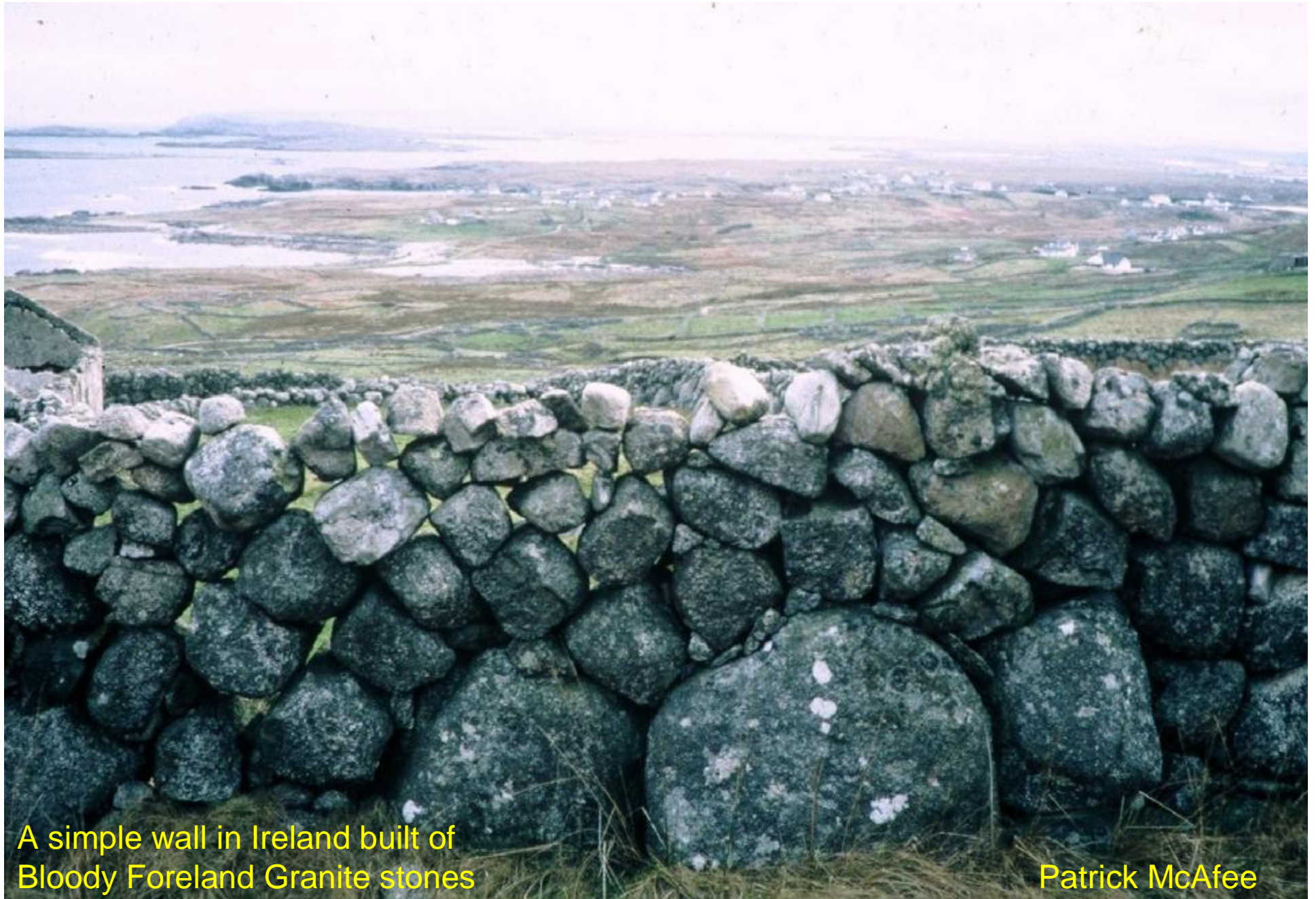
A simple wall in Ireland built of Bloody Foreland Granite stones