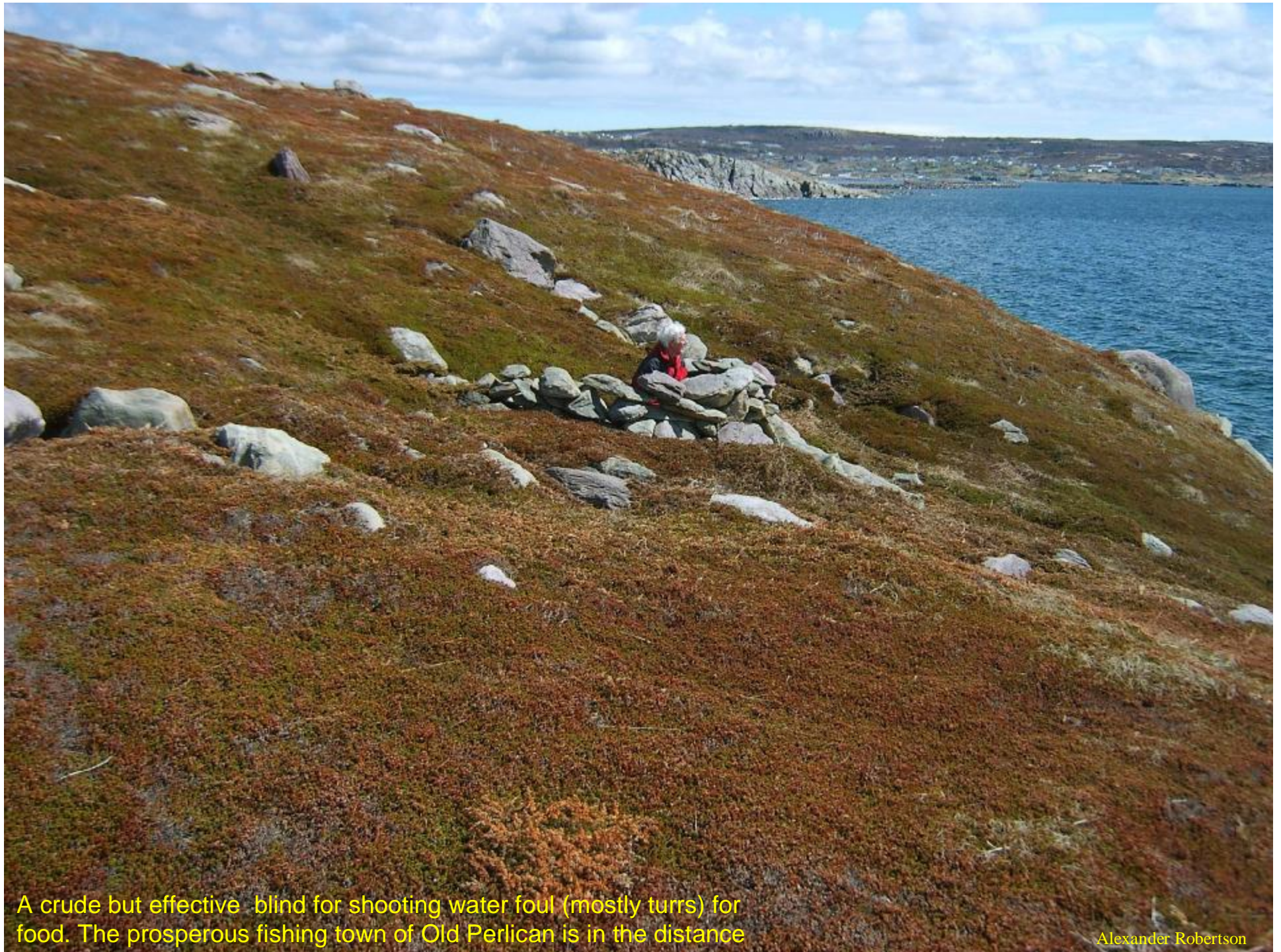
A crude but effective blind for shooting water fowl (mostly turrs) for food. The prosperous fishing town of Old Perlican is in the distance